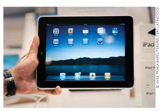
ad Starting at $399

Enjoy superfast data speeds on iPad. Take your network with you everywhere you go. Internet access has never been so easy and convenient. You can also use your iPad to watch movies, store pictures, and as a digital picture frame. Sign up for one of our innovative, no-contract 3G rate plans right on your iPad.