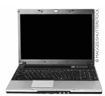
old / light / expensive