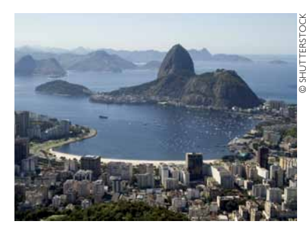
beautiful / big / polluted